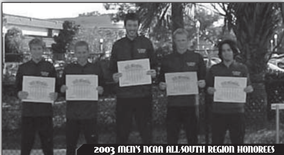
2003 MEN'S NCAA ALL-SOUTH REGION HONOREES