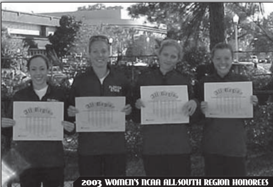
2003 WOMEN'S NCAA ALL-SOUTH REGION HONOREES