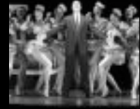
"Crazy For You"

Other sightseeing favorites include the floral masterpiece of Alfred B. Maclay State Gardens; Bradley's Country Store; FAMU Black Archives; and the Tallahassee Antique Car Museum.