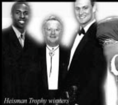
Heisman Trophy winners