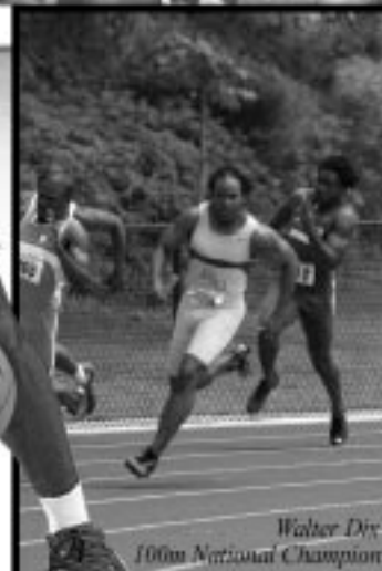
Walter Dix 100m National Champion