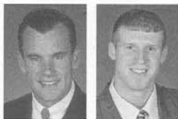
Billy Donovan Head Coach Matt Bonner