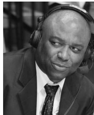
Leonard Hamilton can be heard on the Seminole Radio Network before and after each Florida State game.