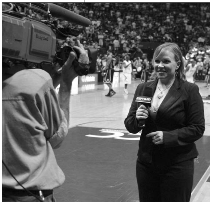
The Seminoles make numerous appearances on national television every year and appear on ESPN throughout each season.