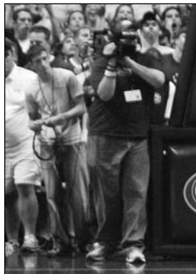
Florida State is one of the most recognized schools in all of college athletics and one of the most televised teams in the nation during college basketball season.

The 2006-07 Florida State basketball media guide has been produced to assist the media in the coverage of the Seminole men's basketball team. Additional information, including press releases, game notes, photographs, photo CDs, video footage and recent news clips are available upon request to all members of the media. Any questions not covered in this publication may be directed to the Sports Information Office.