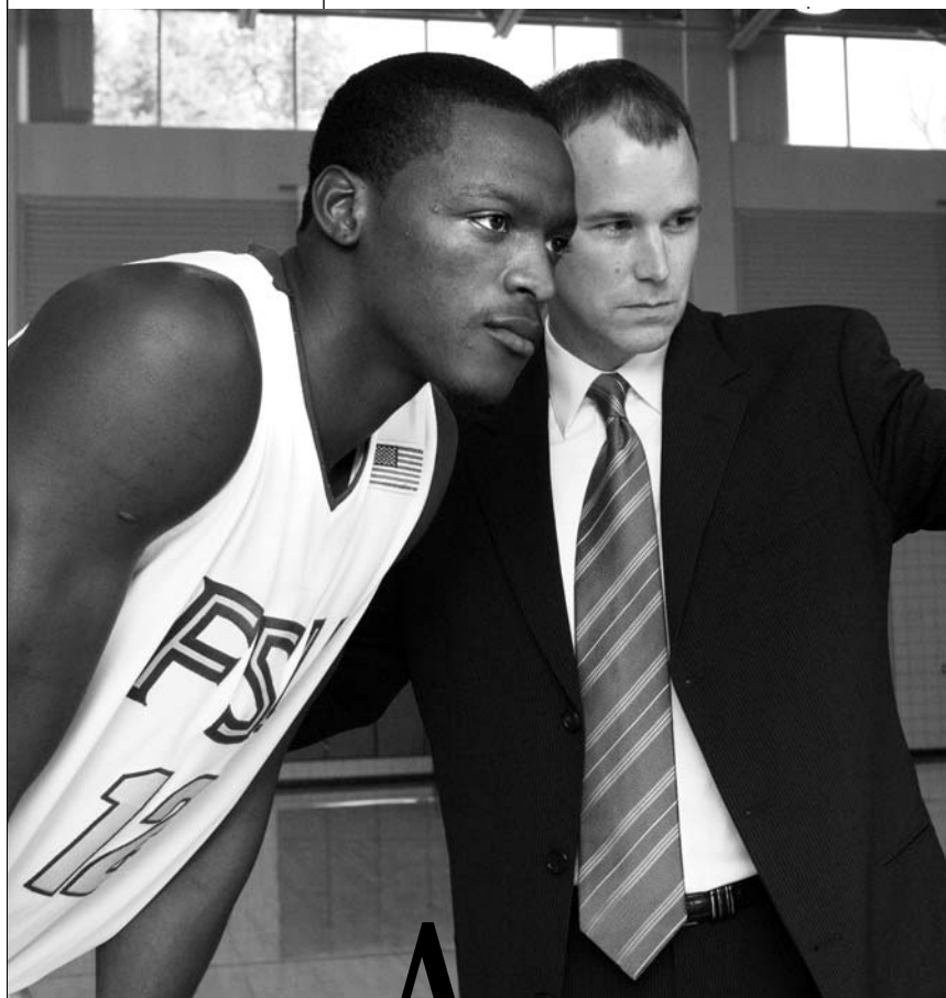
In his first season at Florida State, Andy Enfield is the most sought after shooting specialist in college and professional basketball.

Assistant Coach Johns Hopkins University '91 First Season at FSU