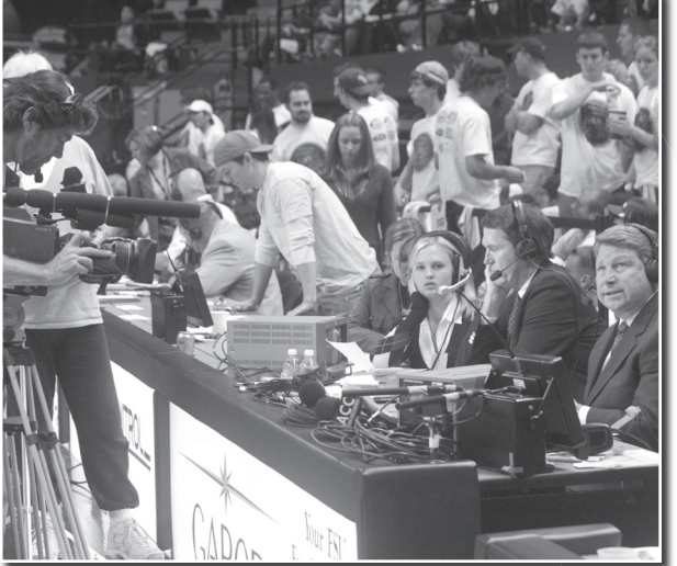
Florida State is one of the most recognizable teams in the country and makes frequent appearances on national and regional television each season.

Parking for media covering the Seminoles at the Tucker Center is available on a very limited basis. The media parking lot is located in the main Tucker Center parking lot. Access is via media parking pass only. Vehicles should enter the Tucker Center lot from Pensacola Street. They will then be directed to the appropriate area. Please contact the Sports Information Office in plenty of time to request a parking pass to be mailed or left at your hotel.