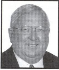
Gene Deckerhoff Play-by-Play