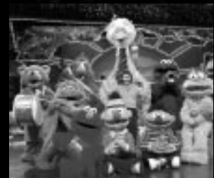
“Sesame Street Live”