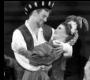
“Kiss Me Kate”

Located downtown on Pensacola Street, the Tucker Center is only two blocks from the Capitol building.