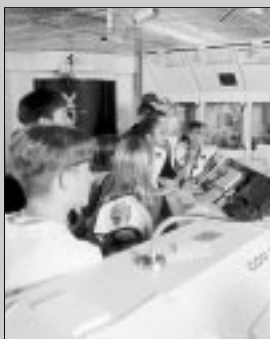
TOP: The Tallahassee Museum of History and Natural Science CENTER: The Museum of Florida History BOTTOM: The Challenger Learning Center