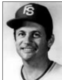
1979 DICK HOWSER