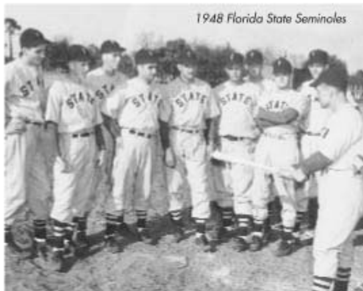
1948 Florida State Seminoles

ind State, 1982; gia State, 1992 gia State, 1992 Clemson, 1959 72 (FS 36, GS 7) 2/4/96 (34-0) 959 (C 24, FS 2) ..... 752, 1982 ..... 464, 1984 948 (17 games) 952 (21 games)