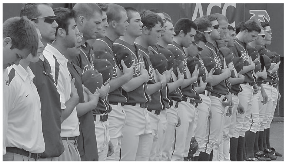
2007 Florida State Seminoles

2008 OUTLOOK COACHING STAFF PLAYER BIOS 2007 REVIEW 2008 OPPONENTS THE RECORD BOOK FSU BASEBALL HONORS & AWARDS ALL-TIME RESULTS SEMINOLES IN THE PROS THE UNIVERSITY