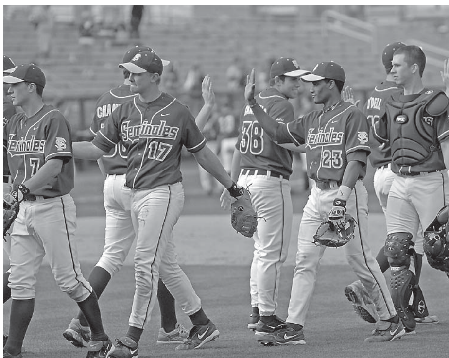
Florida State wins its 16th straight game to start the 2007 season.