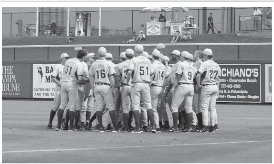
The Seminoles huddle after their exhibition contest against the Philadelphia Phillies in Clearwater, Fla.

2008 OUTLOOK COACHING STAFF PLAYER BIOS 2007 REVIEW 2008 OPPONENTS THE RECORD BOOK FSU BASEBALL HONORS & AWARDS ALL-TIME RESULTS SEMINOLES IN THE PROS THE UNIVERSITY