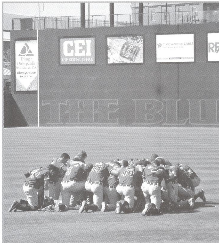
Florida State huddles at the 2009 ACC Tournament in Durham, NC.