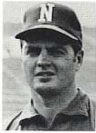
Coach Tom Osborne