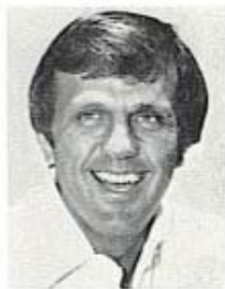
Coach Jackie Sherrill