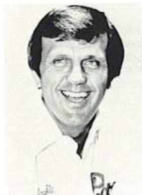
Coach Jackie Sherrill