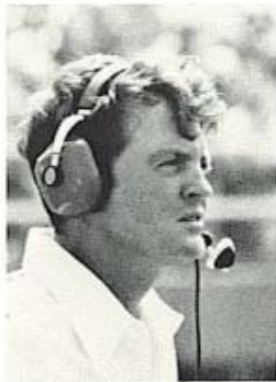
Coach Tom Osborne

SEPTEMBER 19 1:30 P.M. CST LINCOLN, NEB.