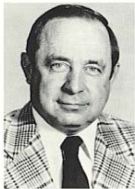
Coach Earle Bruce