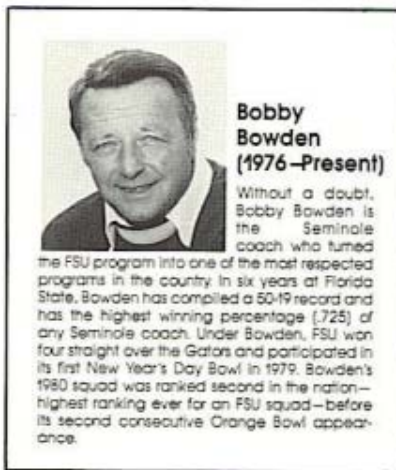
Bobby Bowden (1976-Present)

Without a doubt, Bobby Bowden is the Seminole coach who turned the FSU program into one of the most respected programs in the country. In six years at Florida State, Bowden has compiled a 50-19 record and has the highest winning percentage (.725) of any Seminole coach. Under Bowden, FSU won four straight over the Gators and participated in its first New Year's Day Bowl in 1979. Bowden's 1980 squad was ranked second in the nation—highest ranking ever for an FSU squad—before its second consecutive Orange Bowl appearance.