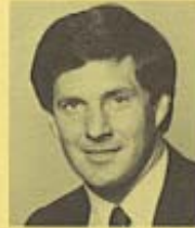
MACK BROWN HEAD COACH