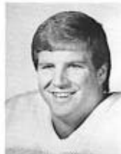
Rusty Trail QUARTERBACK