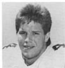
Brett Favre QUARTERBACK