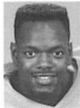
Emmitt Smith RUNNING BACK