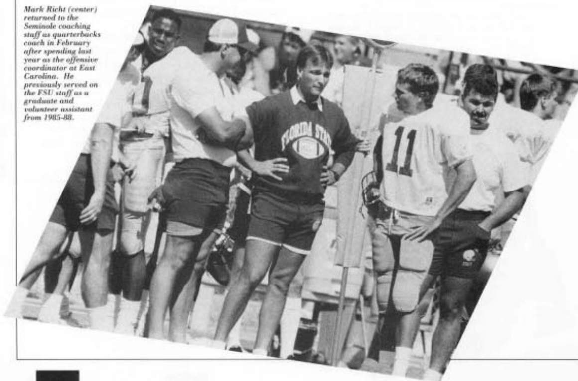
Mark Richt (center) returned to the Seminole coaching staff as quarterbacks coach in February after spending last year as the offensive coordinator at East Carolina. He previously served on the FSU staff as a graduate and volunteer assistant from 1985-88.