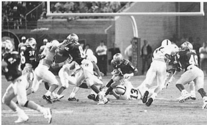
The Blockbuster Bowl game between Florida State and Penn State was one of 20 bowl games played in 1990.

**An NCAA subcommittee had given Independence Bowl officials an August deadline to meet certain requirements before it would recommend recertification of the game. The All-American Bowl did not apply for recertification.