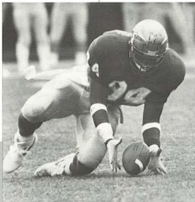
One big reason for Florida State's recent defensive success is turnovers. FSU ranked among the national leaders in turnover margin in 1991.

Last November, Miami ended the longest winning streak in Seminole football history at 16 games. Florida State ended the 1990 season with six straight wins and won 10 straight to open the '91 campaign. The second longest string of wins for FSU came in the late '70s, when the 1978-79 teams strung together 15 consecutive wins from the eighth game of the '78 season until the 11th game of 1979.