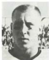
FRED BILETNIKOFF 1964