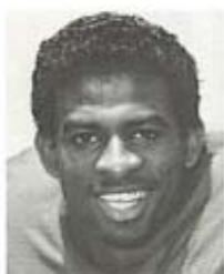
DEION SANDERS 1987-88