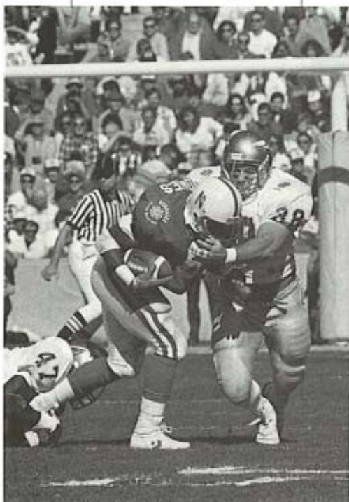
One of the most exciting bowl games ever played saw Florida State score on a fourth down play in the final quarter to claim the first of its two Fiesta Bowl victories over Nebraska.