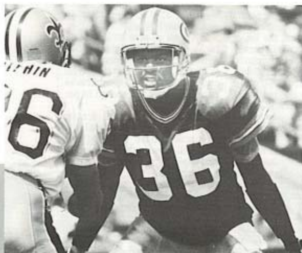
Cornerback LeRoy Butler will be joined by another former Seminole All-American in the Green Bay secondary as the Packers drafted Terrell Buckley in the first round of last year's draft.