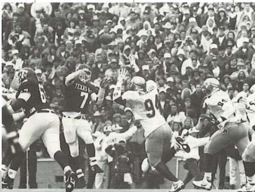
In 1992, Florida State tied the NCAA record for consecutive bowl wins with its seventh in seven seasons when it won the 1992 Cotton Bowl, 10-2, over Texas A&M.