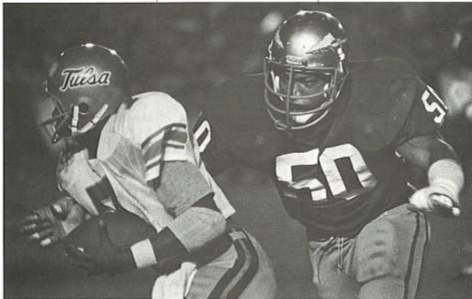
Florida State's top defender ever, Ron Simmons, and his cohorts on the 1979 and '80 defensive units led the Seminoles to a pair of Orange Bowl berths.

Most First Downs - 36, vs. East Carolina, Sept. 20, 1980 Most First Downs, Both Teams - 56, vs. Memphis State, Nov. 18, 1989 Most Rushing First Downs - 24, vs. East Carolina, Sept. 20, 1980 Most Rushing First Downs, Both Teams - 32, vs. Auburn, Oct. 23, 1976