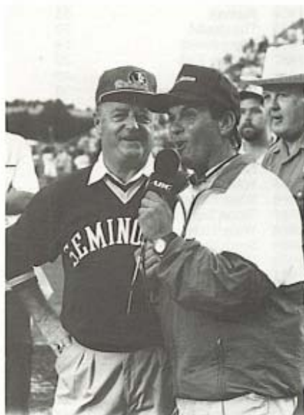
Seminole Head Coach Bobby Bowden and his teams are a favorite of the national networks.

on television is 49-26-3 since the first showing, in the 1958 Bluegrass Bowl against Oklahoma State on ABC. FSU has appeared on that network more than any other, with 37 appearances. CBS has televised 11 Tribe contests, WTBS nine and ESPN 12, including five games in 1989.