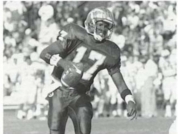
In addition to his exploits on the football field, Charlie Ward was named to the ACC's All-Academic Football Team last year and is on track to graduate in December.