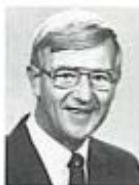
Lou Holtz Head Coach