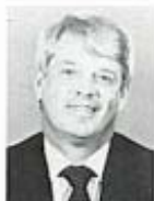
Dennis Erickson Head Coach

OCTOBER 9 • 12:00 PM EDT • TALLAHASSEE, FL • DOAK CAMPBELL STADIUM