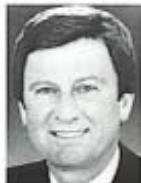
Steve Spurrier Head Coach

NOVEMBER 27 • 12:00 PM EST • GAINESVILLE, FL • BEN HILL GRIFFIN STADIUM