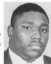
WARREN SAPP Defensive Tackle