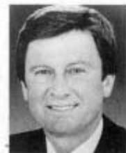
STEVE SPURRIER Head Coach