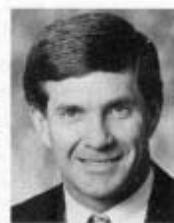
MACK BROWN Head Coach