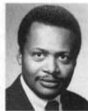
JIM CALDWELL Head Coach

WF OPP VANDERBILT 12-27 NORTH CAROLINA STATE 16-34 APPALACHIAN STATE 20-3 at Northwestern 14-26 at North Carolina 35-45 at Clemson 20-16 DUKE 13-21 at Florida State 0-54 at Virginia 9-21 GEORGIA TECH 28-38 MARYLAND 32-33