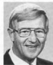
LOU HOLTZ Head Coach

27-12 27-23 36-14 17-0 48-20 44-0 45-20 31-13 58-27 31-24 39-41 24-21