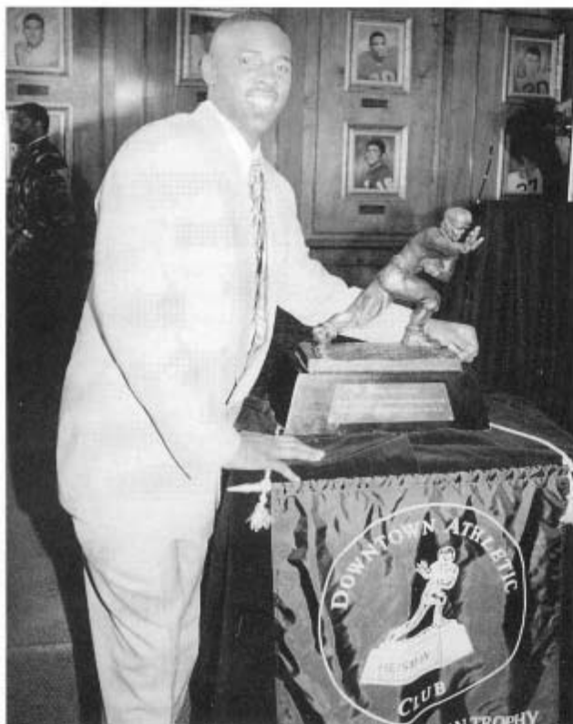
Charlie Ward won a record 15 national awards last year including the 1993 Heisman Trophy.