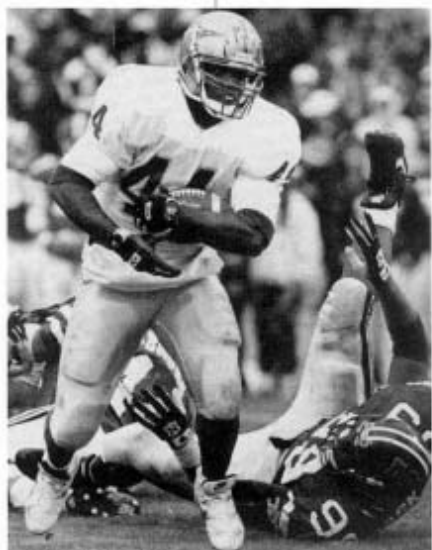
Florida State's offense was diverse enough in 1993 to either go through...