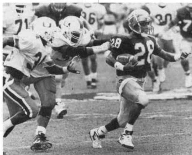
or around most of its opponents en route to a 12-1 record and the national championship.