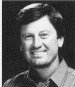
STEVE SPURRIER Head Coach