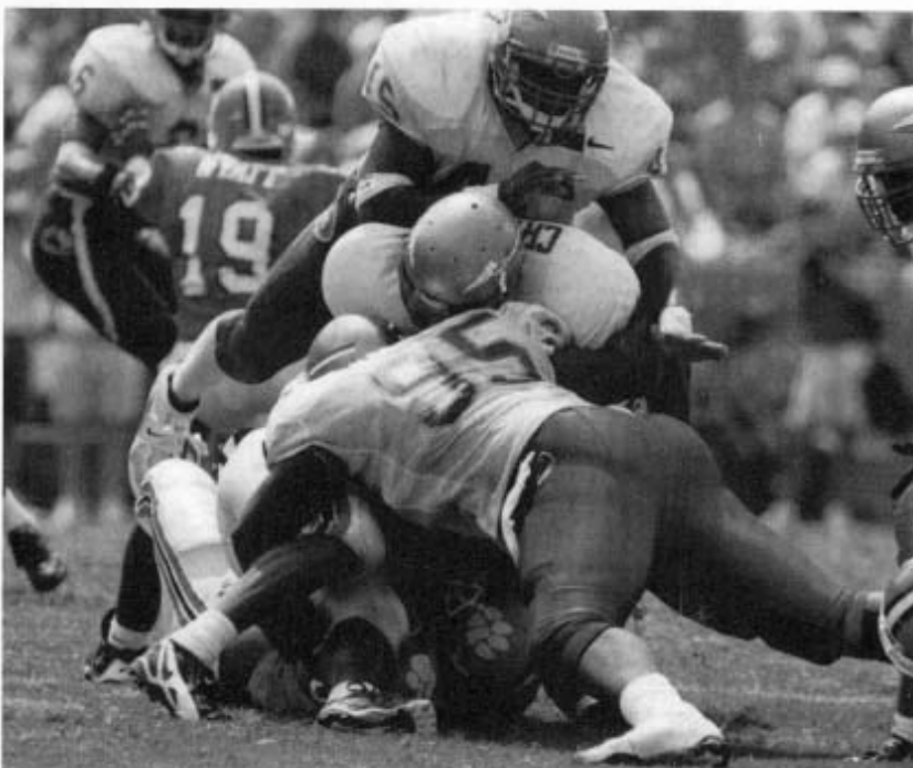
FSU must travel to Clemson, along with trips to USC, Duke, N. Carolina, Virginia and Florida.