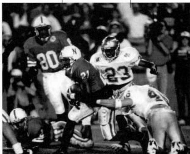
Florida State's defense wrapped up a consensus National Championship in 1993 by stopping Nebraska's vaunted running game in the Orange Bowl.

*Beginning in 1974, by agreement with the American Football Coaches Association, teams are ineligible for ranking and national championship consideration by the UPI Board of Coaches.