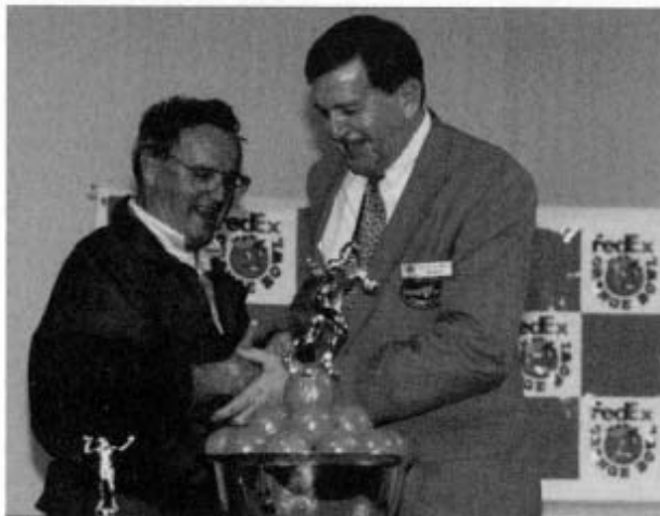
Only eight teams have won more bowls than FSU's 15.