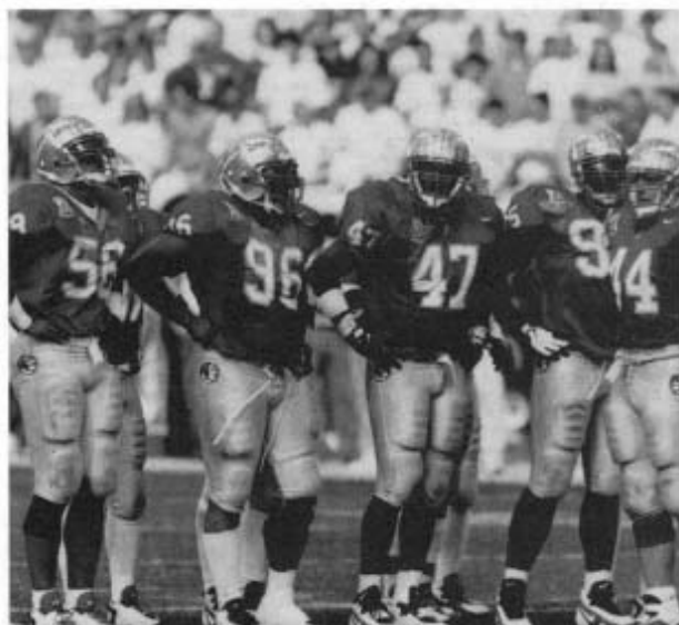
FSU's defense was the nation's best against the run last year.