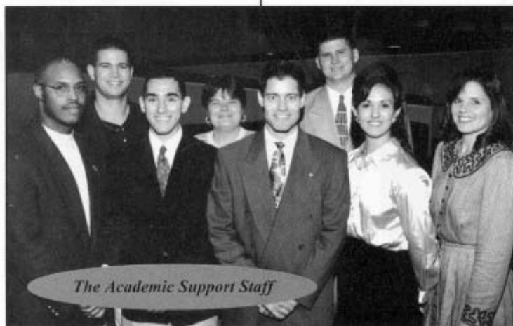
The Academic Support Staff