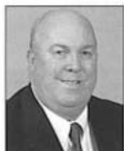
RALPH FRIEDGEN Head Coach

OCTOBER 30 • BYRD STADIUM • COLLEGE PARK, MD