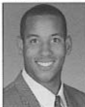
CHRIS LEAK Quarterback