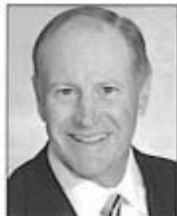
AL GROH Head Coach

OCTOBER 16 • DOAK CAMPBELL STADIUM • TALLAHASSEE, FL