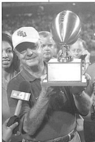
FSU won the 2002 Eddie Robinson Classic.