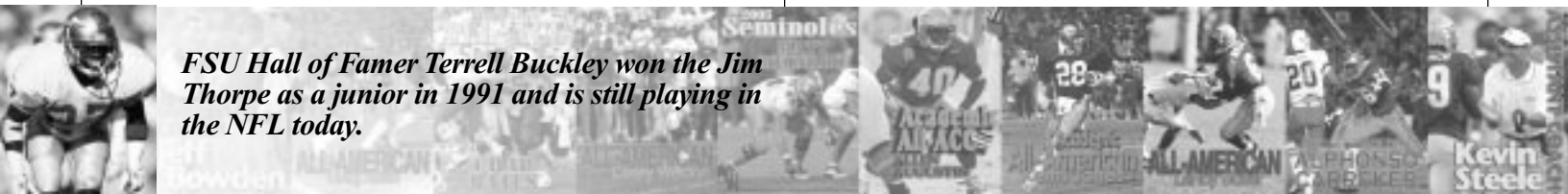
FSU Hall of Famer Terrell Buckley won the Jim Thorpe as a junior in 1991 and is still playing in the NFL today.