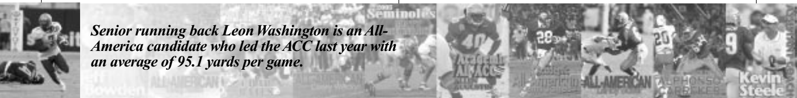
Senior running back Leon Washington is an All-America candidate who led the ACC last year with an average of 95.1 yards per game.