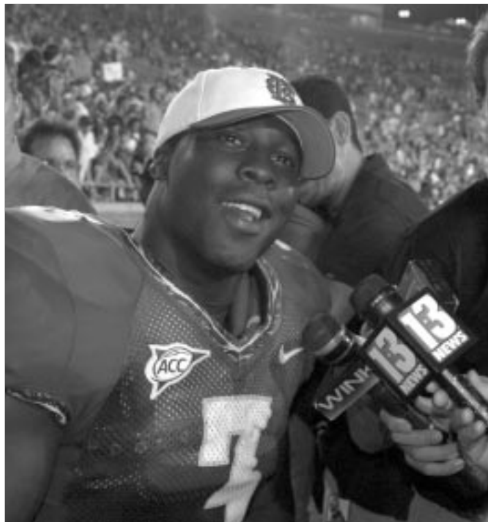
Tailback Leon Washington speaks to the media after the victory over Miami in last year's opener. Washington was selected in the fourth round by the New York Jets in this year's NFL Draft.