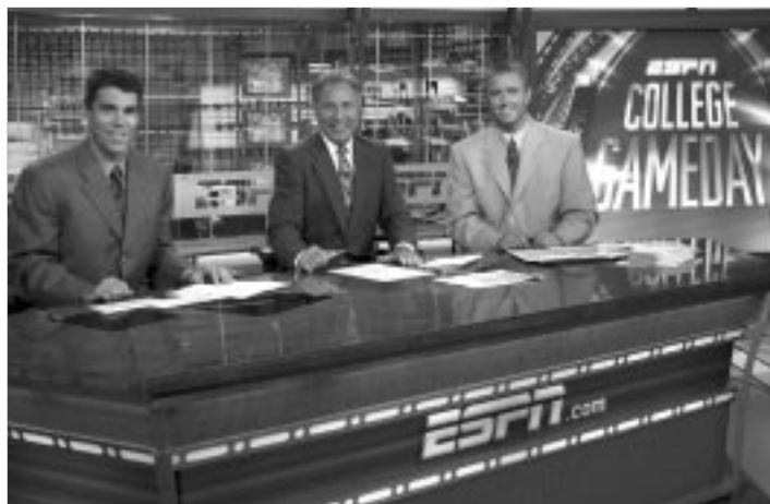
The Seminoles are always a popular choice when ESPN's College Gameday leaves the studio to visit college campuses across the country. Lee Corso was a quarterback and defensive back at Florida State from 1953-56.