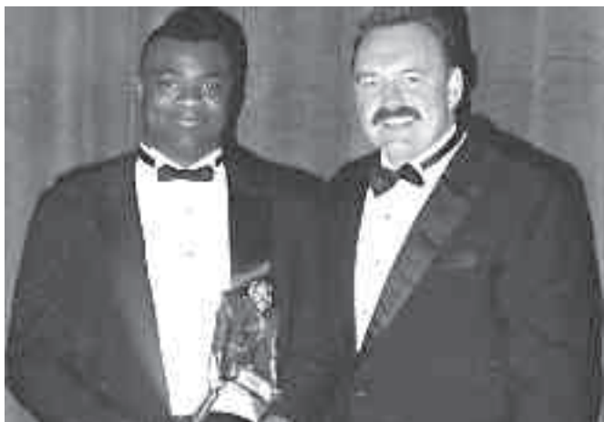
Marvin Jones INSIDE LINEBACKER, 1990-92 1992 BUTKUS AWARD WINNER

EMBLEMATIC OF THE NATION'S TOP COLLEGIATE LINEBACKER, ESTABLISHED BY THE DOWNTOWN ATHLETIC CLUB OF ORLANDO AND NAMED FOR COLLEGE HALL OF FAMER DICK BUTKUS OF ILLINOIS.