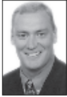
2000 CHRIS WEINKE (QB)