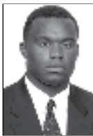
2006 MYRON ROLLE (S)