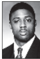
1996 WARRICK DUNN (RB)