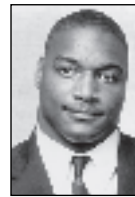
1992-94 DERRICK BROOKS (LB)