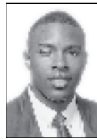
1992-93 CHARLIE WARD (QB)