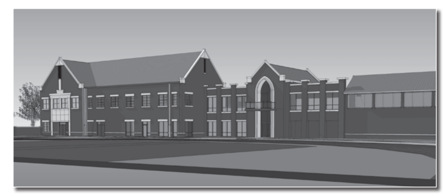
View from the track