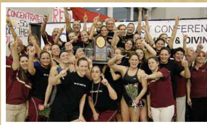
The 2006 Women's ACC Championship Team.