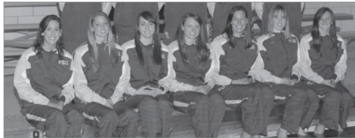
2007-08 Freshman Class