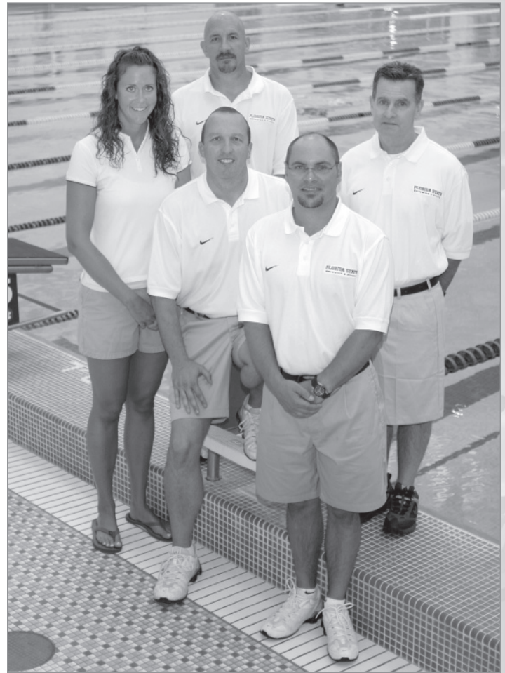
2007-08 Coaching Staff