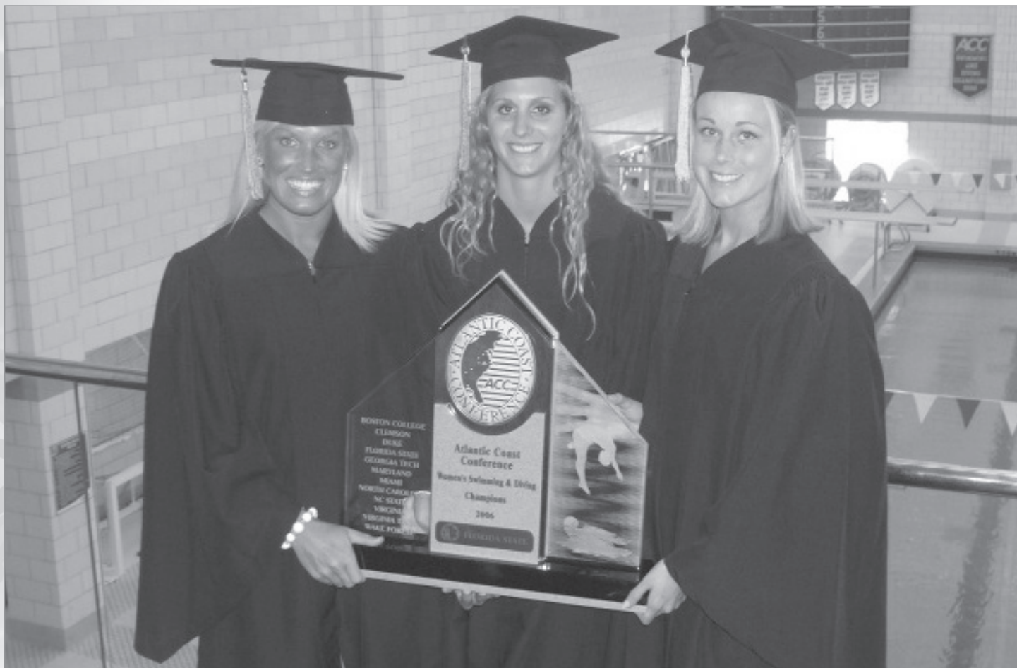
Florida State finished 17th at the NCAA Championships, after narrowly missing on a repeat as conference champions.