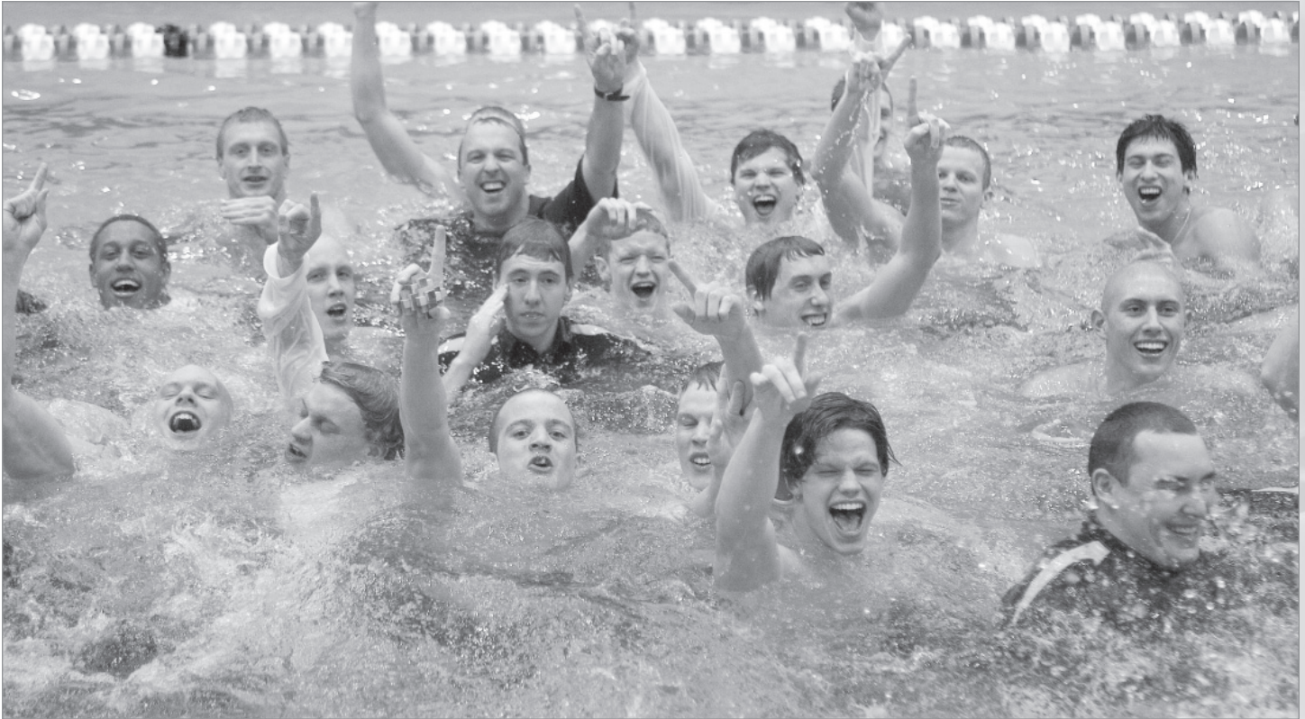
The seminole captured their first ACC title in 2006-07.