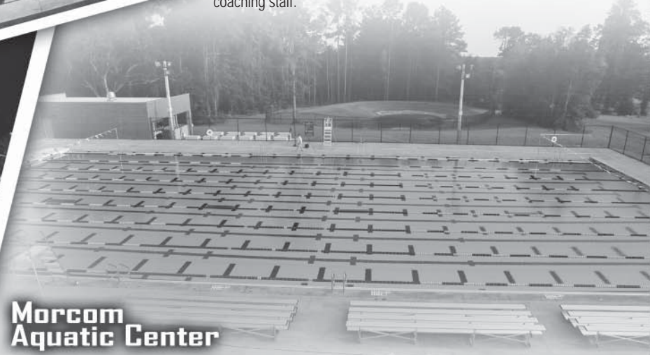
Morcom Aquatic Center