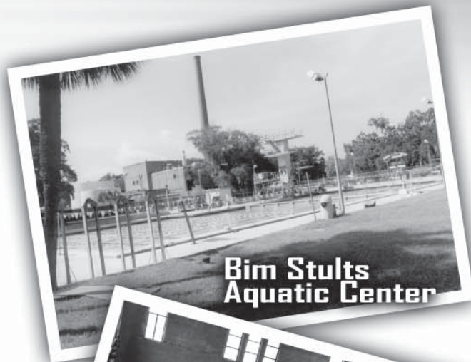
Bim Stults Aquatic Center

After nearly 30 years of swimming at the Stults Aquatic Center, Florida State made the move indoors to the Bobby E. Leach Center in 1991. The Leach Pool is a 16-lane by 25-yd indoor swimming facility with two 1-meter and two 3-meter diving boards. FSU split time between the two pools for several years, but after the closing of the Bim Stults Aquatics Center in the Fall of 2003, the Seminoles moved permanently to the Leach Center Pool. Florida State hosted dual meets at the Leach Center for 16 years including the 1993 ACC Championships and will continue to host the team during inclement weather.