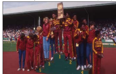
1984 NCAA Outdoor Champs