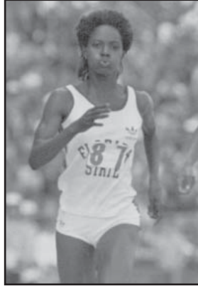
Marita Payne: 20-time All-American