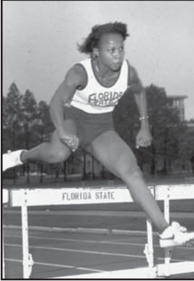
Tonja Brown: 1982 400 hurdles champ