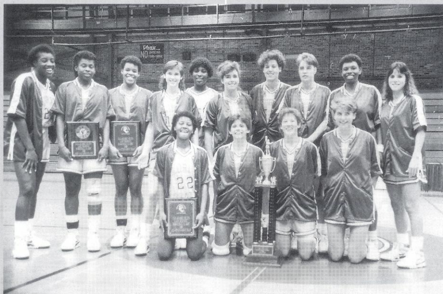
THE SEMINOLES HAVE TWICE BEEN TO THE NCAA NATIONAL CHAMPIONSHIP TOURNAMENT THUS FAR IN THE 1990s.

*Montana State Classic **Dial Classic, Tallahassee, FL #San Juan Shootout, San Juan, PR +ACC Tournament, Rock Hill, SC