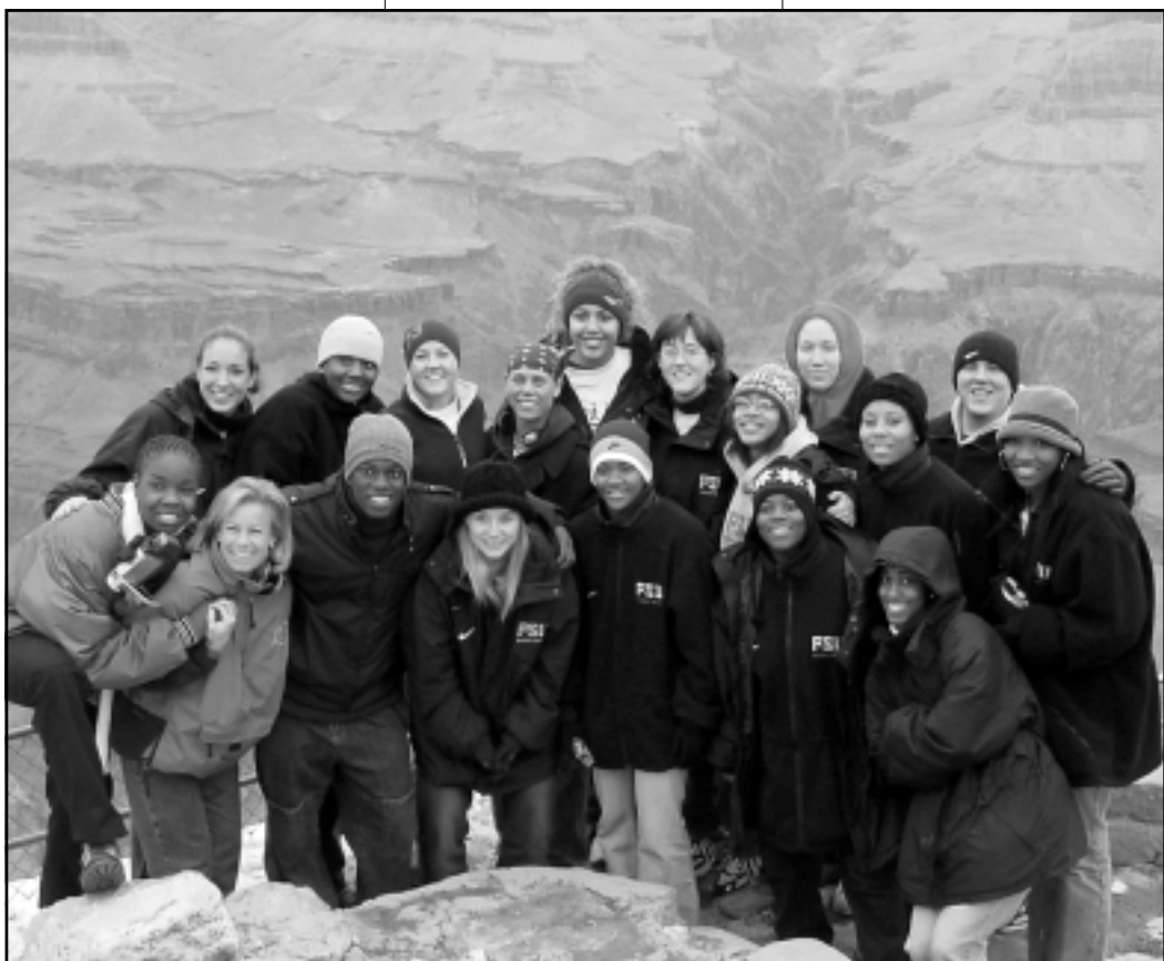
The Florida State women's basketball team has the opportunity to travel to different parts of the country each season. In 2002-03, the Seminoles visited the Grand Canyon while in Arizona in December.

*Seminole Classic **ACC Tournament, Greensboro, NC ***WNIT