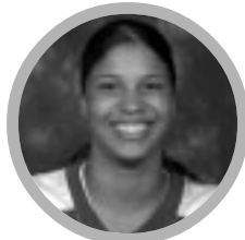
Jovone Markey Center