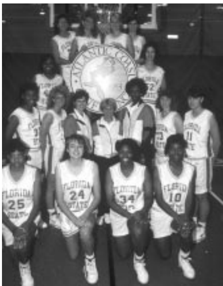
1991-92 Seminoles – Florida State's first ACC team.