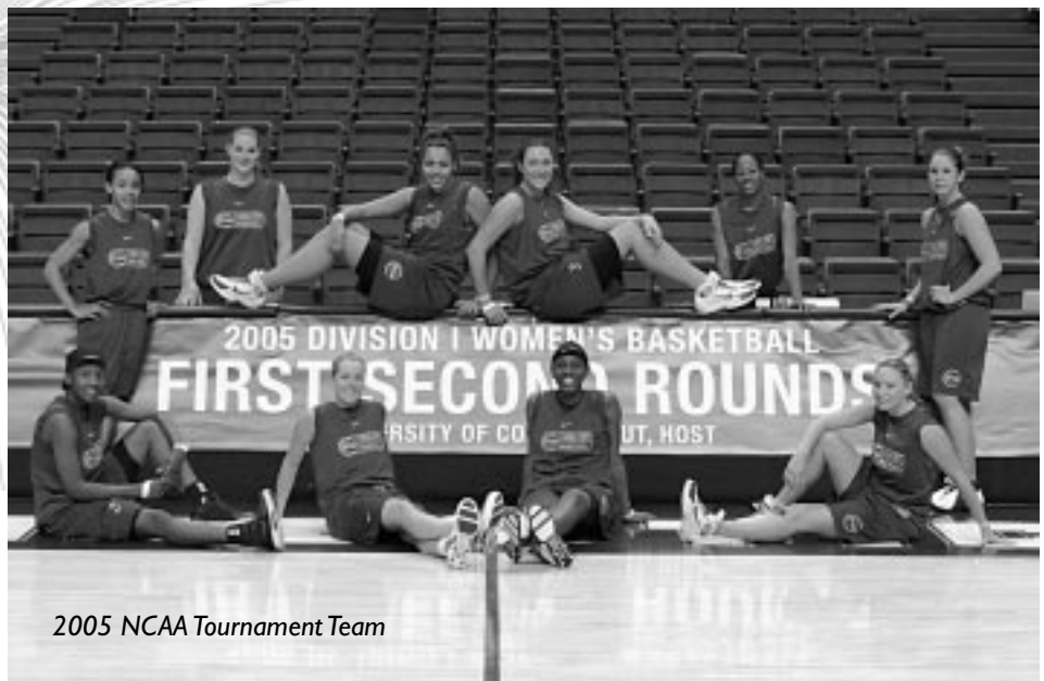
2005 NCAA Tournament Team