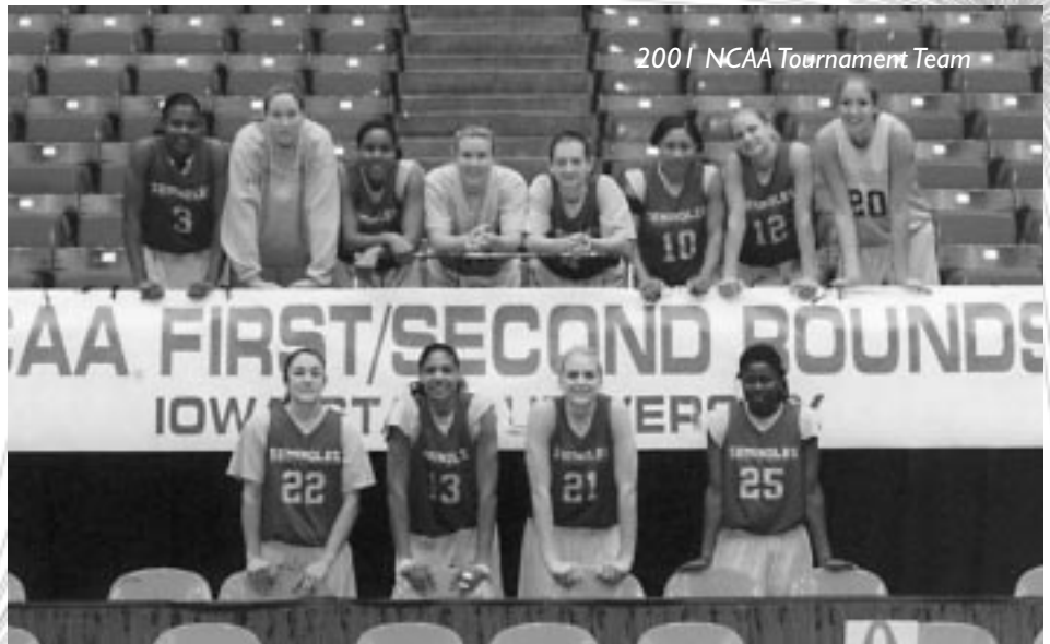
2001 NCAA Tournament Team