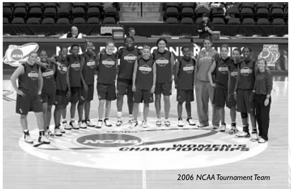
2006 NCAA Tournament Team