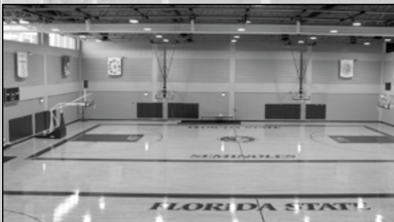
Two regulation-sized basketball courts are located on the second floor of the facility. The cushioning for the courts is composed of ground up Nike shoes.