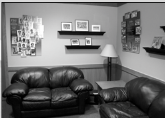
The locker room, located on the first floor, consists of four rooms: the player lounge, the study room, the dressing and locker room and the restroom and shower area.