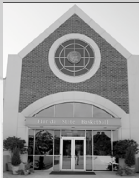
The third level entrance, located on the north side of the complex, connects to a walkway leading directly to the Tucker Civic Center.