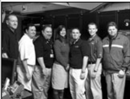
The Seminole Productions Staff

In the summer of 2004, Seminole Productions moved to a new 6,000