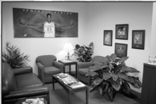
The coaches office suite is on the third floor, which has a balcony overlooking the practice courts.