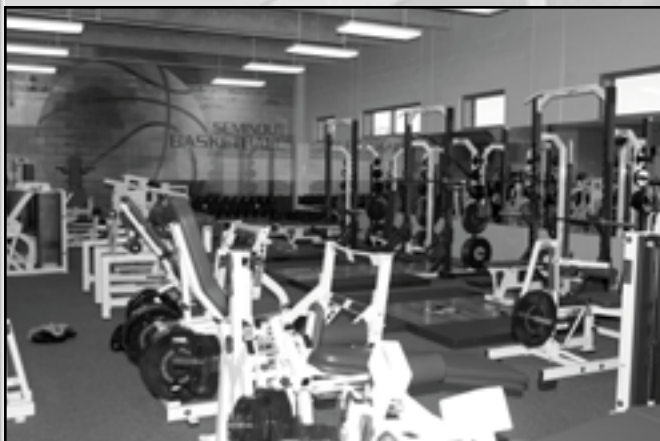
The team meeting room, strength and conditioning room and athletic training room are located on the second floor, just across the hall from the practice courts.