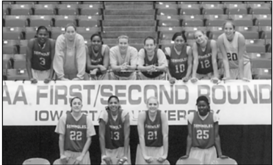
2001 NCAA Tournament Team