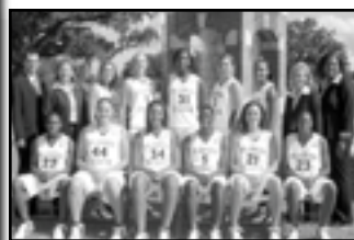
2004-05 (24-8, 9-5 ACC)