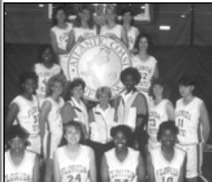
1991-92 Seminoles – Florida State's first ACC team.