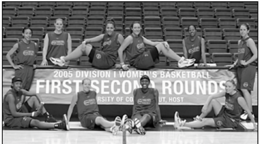
2005 NCAA Tournament Team