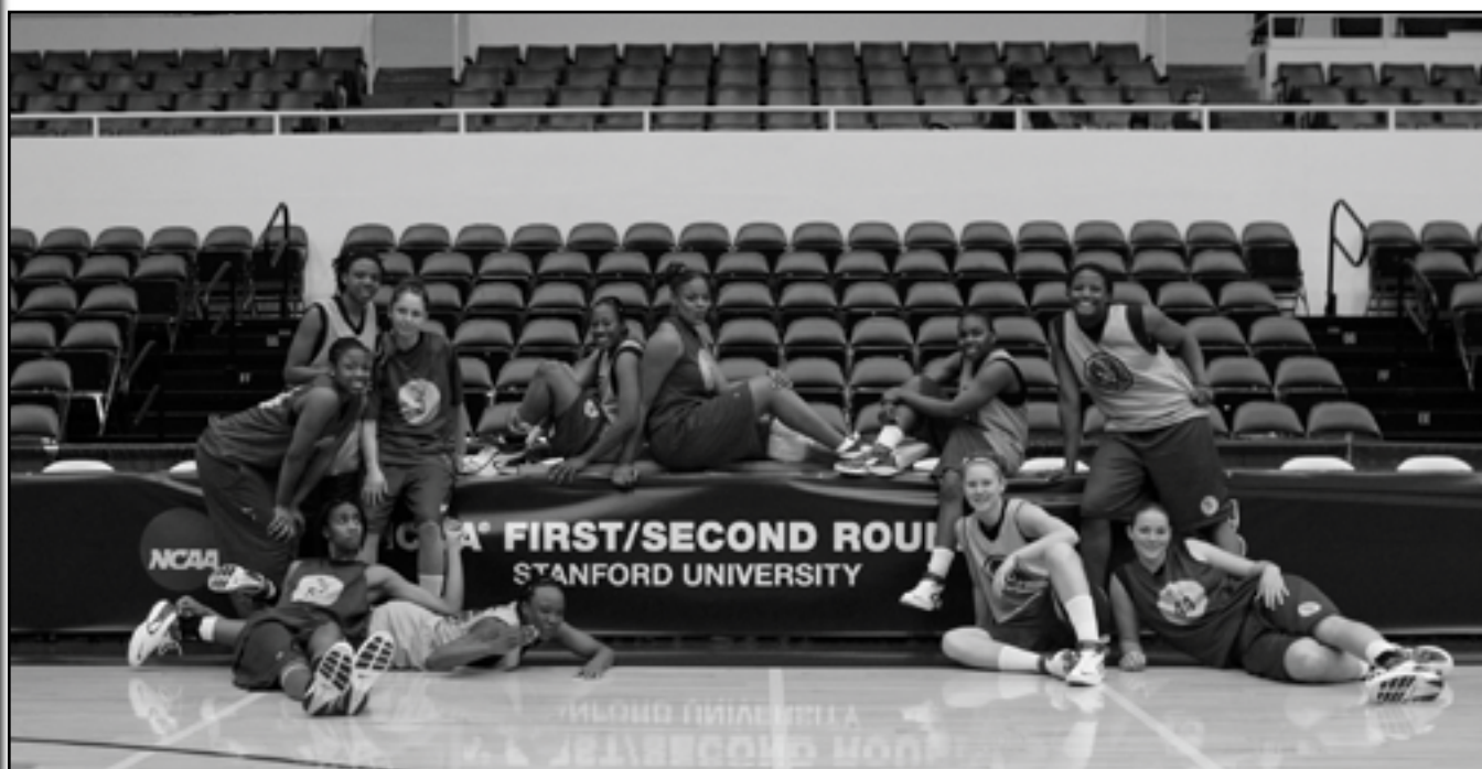
2007 NCAA Tournament Team