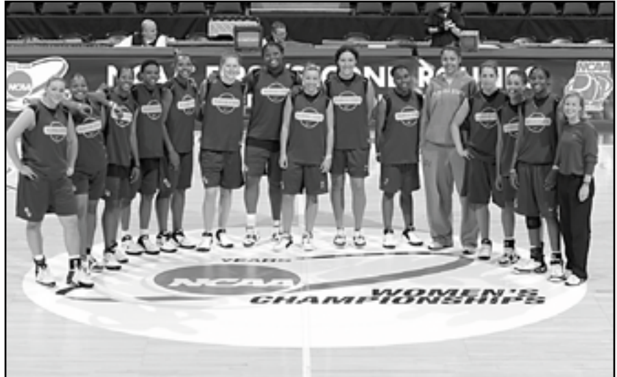
2006 NCAA Tournament Team