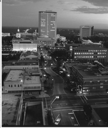
Florida State University is located in Tallahassee – the capital city of the state of Florida.

Near, but far from the glaring strips of neon amusement and the castles and crowds of Disney, lies another magical place in the Sunshine State – one of pow-wows, plantations, politics and great pride.