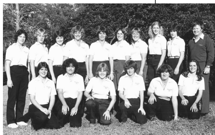
Florida State's 1981 AIAW National Championship Team.